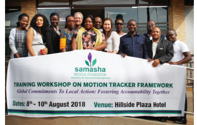
Orientation meeting of Country Partners on Motion Tracker in Kampala-Uganda

Building capacity of local CSOs on Motion Tracker: Using the participatory and proprietary advocacy tool dubbed Motion Tracker, Samasha built capacity of selected local conveners in select countries with the aim of supporting these countries realize their global FP/RH commitments. The Motion Tracker is a