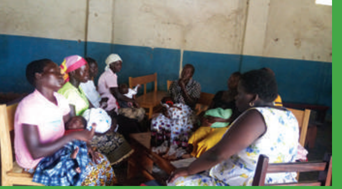
Focus Group Discussion in Adjumani district

the quality and coverage of Emergency Obstetrical and Neonatal Care (EmONC) services in 324 public and (PNFP) private-not-for-profit health facilities in 25 targeted districts that offer maternity services. This assessment was used to generate baseline information on emergency obstetric and neonatal interventions leading to the development of district-specific action plans.