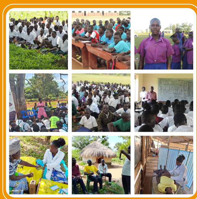
Photo collage of the school and community health outreaches in Luwero and Kole Districts