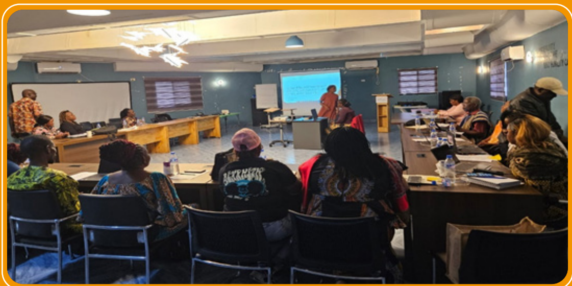
Participants during one of the validation meetings in Liberia