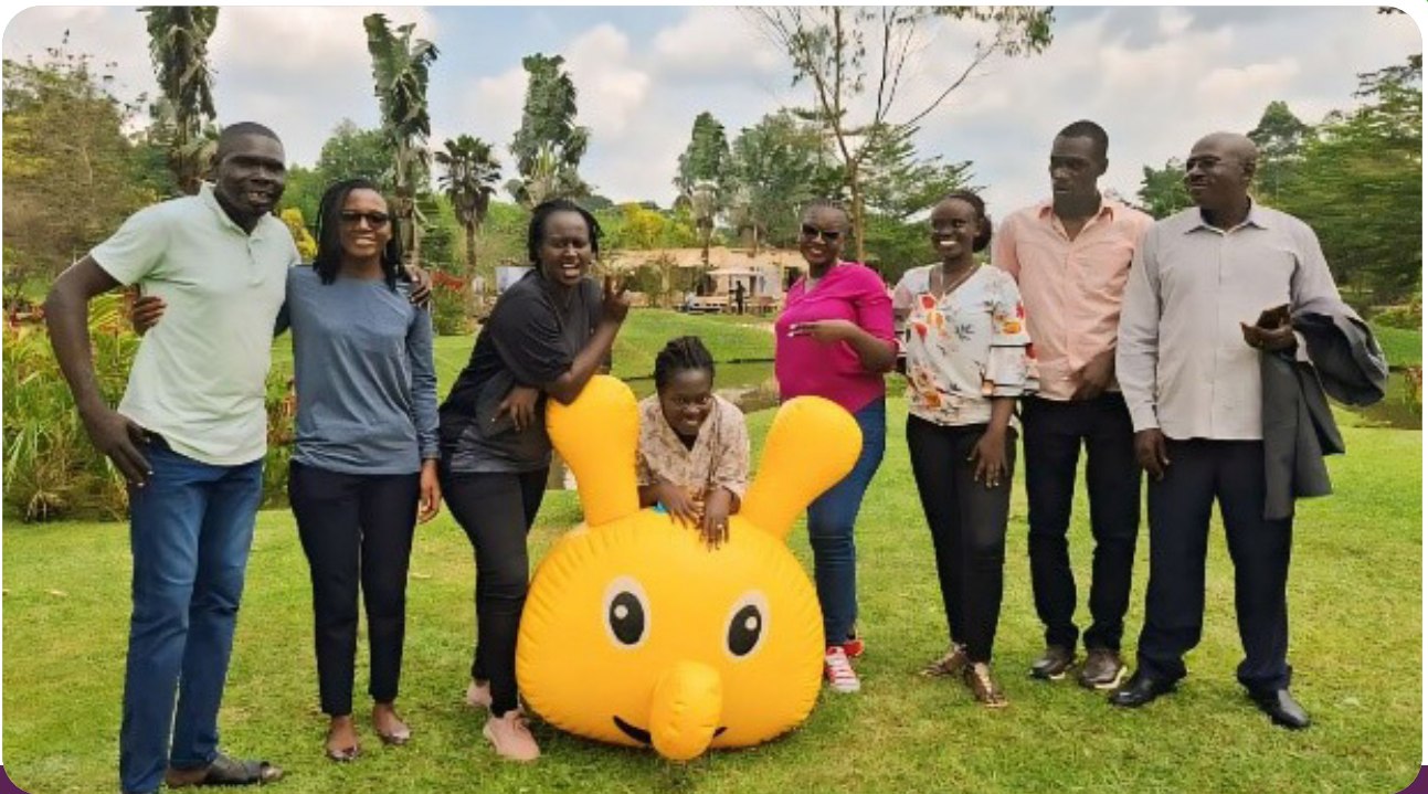
The Samasha staff on a photo moment during the team building.

Samasha held a two-day staff retreat to reflect, strategize, and align priorities for the year ahead. The retreat focused on enhancing team capacity, fostering collaboration, and strengthening Samasha's impact in health advocacy and accountability.