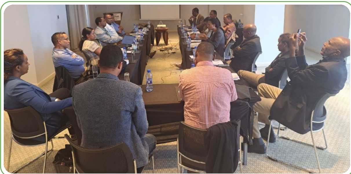
FP2030 Stakeholder Validation meeting hosted by CORHA-Ethiopia