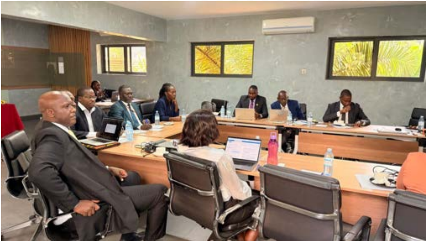
Figure 4: Samasha, Ministry of Finance, Ministry of Health and GHA during a budget review meeting for Epidemic Preparedness.

This funding gap jeopardized the nation's readiness to respond to future health crises. To counter this trend, Samasha, in partnership with the Global Health Advocacy Incubator (GHA), the Ministry of Health (MoH), the Ministry of Finance, Planning and Economic Development (MoFPED), the Office of the Prime Minister (OPM), and various CSOs, worked to track health security funding, identify shortfalls, and advocate for proactive financing. These efforts raised epidemic preparedness as a national priority and strengthened the role of civil society in overseeing budget allocations.