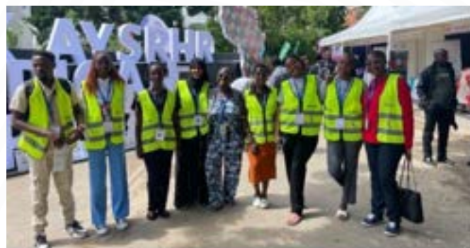
Figure 7: Picture moments from the RHNK scientific conference

The dialogue was not just talk, it shaped real action. The outcomes from the Town Hall fed directly into the main conference, where a Youth Declaration was signed, cementing the commitment to inclusive, youth-led advocacy in shaping Uganda’s health and human rights