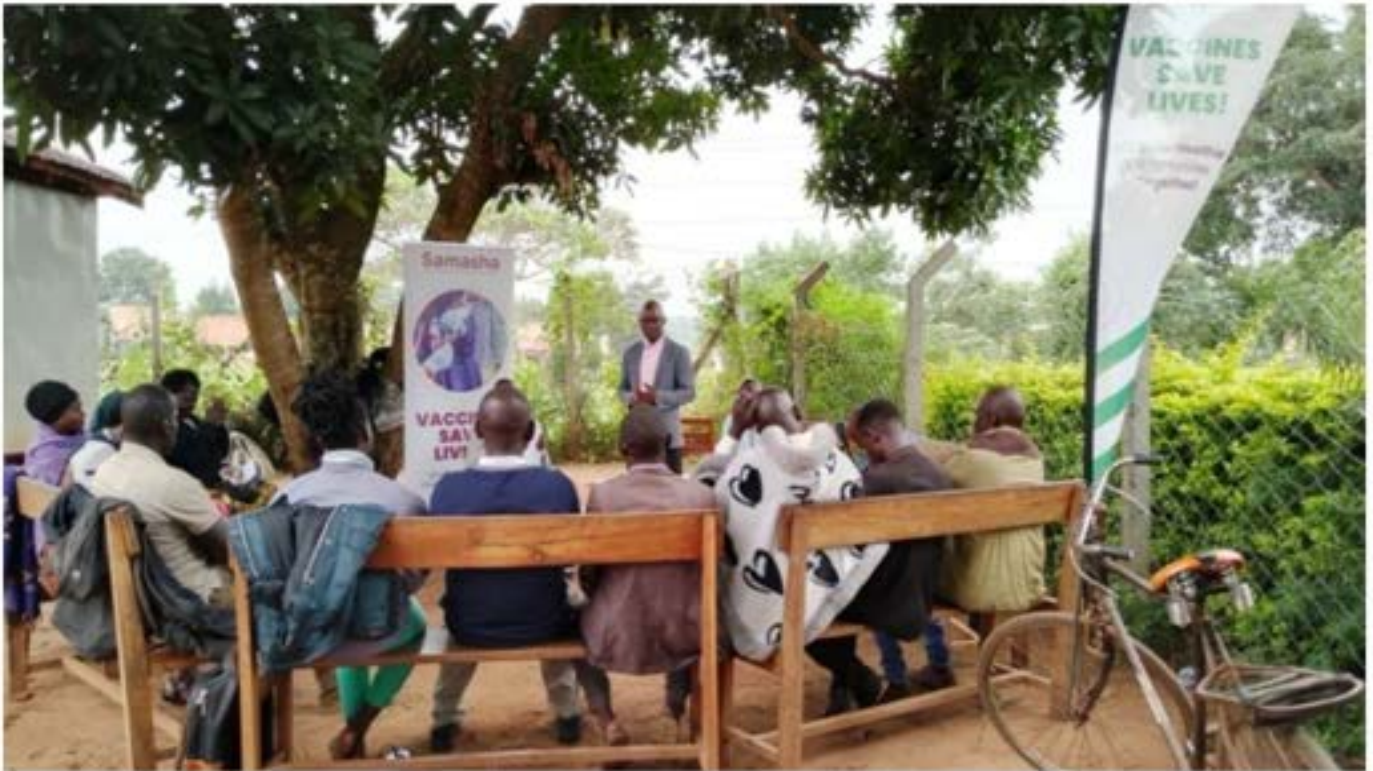
Figure 2 Community leaders during a pastoral dialogue meeting in Kyankwanzi district