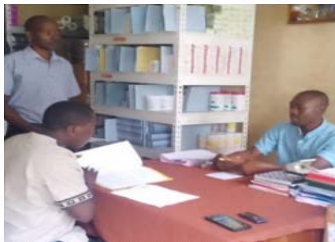
Figure 5: Nyamirami HCIV team, including the HMIS Focal Person and Inventory Management Officer, reviewing supply chain updates and performance in Rwenzori Region