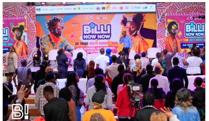
Figure 6: Pictorial: Bili Now Now youth summit

In partnership with RAHU and CEHURD, Samasha proudly continued its mission to amplify youth voices and champion adolescent health across regional and continental platforms. The summit became a space for real conversations, shared dreams, and powerful ideas—fostering meaningful engagement and nurturing a new wave of Pan-African youth leadership.